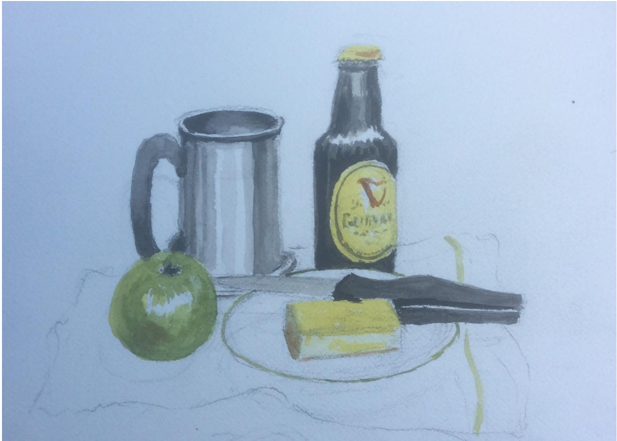
Still Life watercolor (unfinished) at the May 12th. mtg.