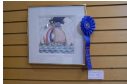
Sailing the Deep Blue Sea