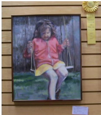
Girl on a Swing