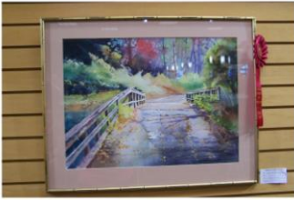
Road to the Glen