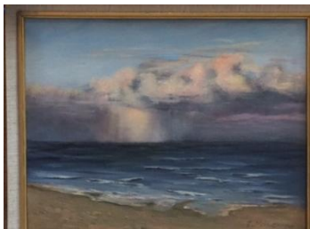
1st place "Storm over the Lake" Eleanor Milborrow