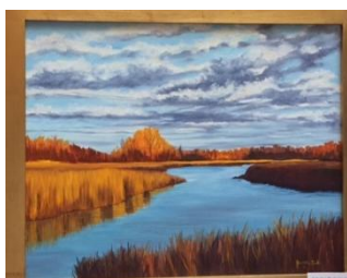
HM "Brush Creek" Juanita Link