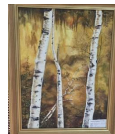
HM "Birches" Tatyana Bletsko.