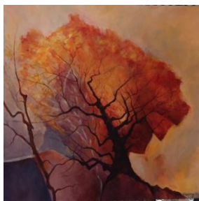
3rd place" Burning Tree" Tess Lindsay