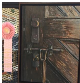
HM "Locked" Eleanor Milborrow